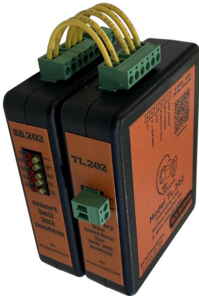
Model SB.202 and Model TL.202