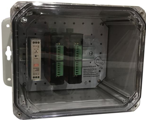
NEMA-6P / IP-68 Enclosure for TheSignalizer™ (Electronic Components Not Included)